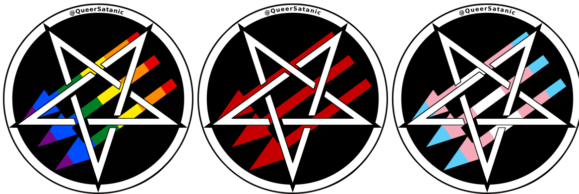
Satanic Antifascism logo and variants